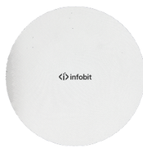
Mesh Cover: 1pcs